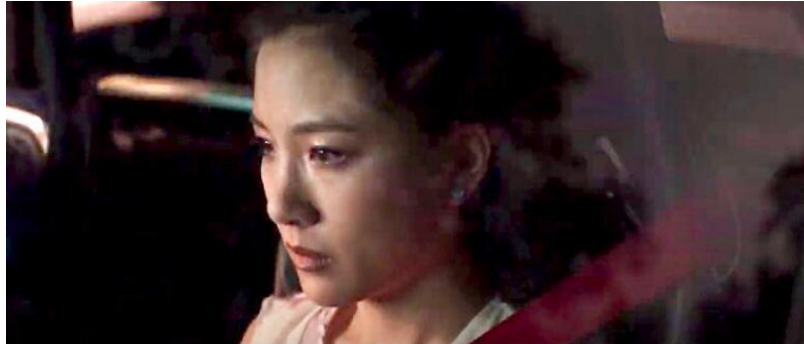
Figure 6. Rachel's Sad Expression

anymore, and leaves the group. This also happens in movie Crazy Rich Asians . A woman who tried hard to be part of a group, but was still treated differently by a group.