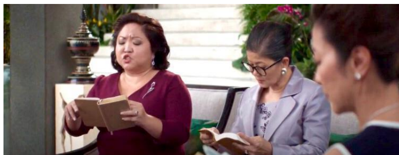
Figure 4. Praying to God

Religious discrimination is a treatment that discriminates a certain person or group based on their religion. For example, in area A, the majority of the population adheres to Hinduism, but there is a person or group of people who are Confucian living there. It is likely that that person or group of people who are Confucian will receive a different treatment from other people.