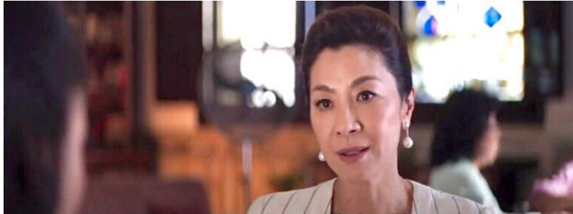
Figure 3. Eleanor Rejected Rachel as Part of the Family

This shows that the main character, Rachel who was not acknowledged as a Chinese. Eleanor insisted that Rachel was an American. Although Rachel was a Chinese, the culture that she adopted was western culture and that was unacceptable to Eleanor.