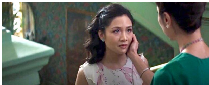
Figure 5. Eleanor Claimed that Rachel Did Not Meet Eleanor's Family Standard

Discriminatory behavior can be done by someone physically or verbally. A person who does not like someone for some reason is willing to do anything to get rid of the person that he or she does not like. This action can hurt the victim's feeling because of the behavior he or she does not deserve. The main character in this film also experienced some verbal discrimination, one of which was when Eleanor said that Rachel was not good enough for her family. It can be seen from Figure 5.