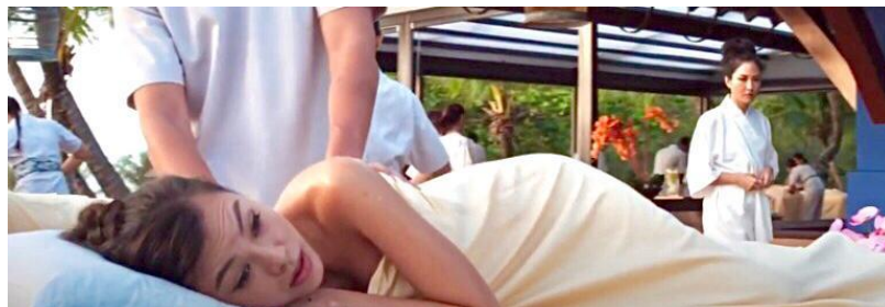
Figure 2. People were Talking about Rachel

Figure 1 shows people staring at the main character, Rachel. She could feel it and wondered why people were looking at her. People stared at Rachel because she had a striking difference from others that attracted people's attention. Figure 2 shows a woman saying that Rachel should have undergone a plastic surgery for her ordinary face to be more beautiful. This brought her to sadness and she immediately walked away into her lodging house.